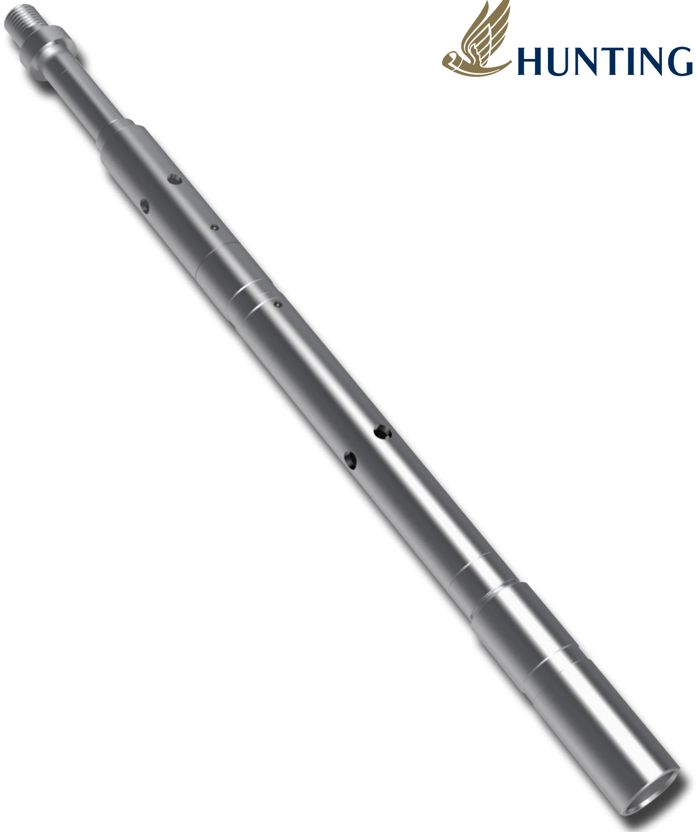
1-3/8" Jar Down/Direct Pressure Firing Head Titan Division | Firing Heads